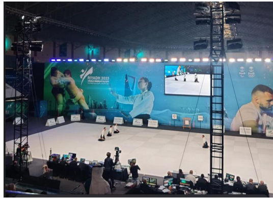
Demonstration area at KSU.

The demonstration area consisted of a white tatami big enough for the entire group to practice together before Embukai.